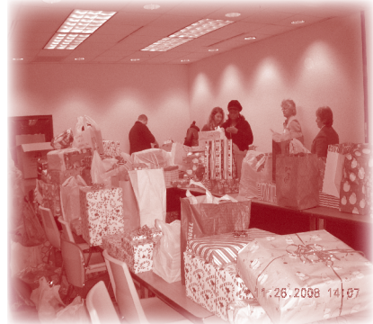
A roomful of cheer!