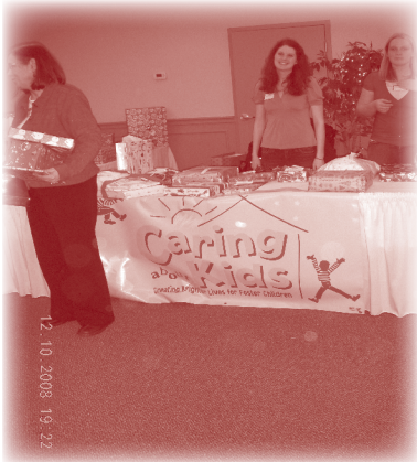
DHS workers playing Santa at the holiday party.

The 2008 Holiday Party for foster children and families was held on December 10, 2008 and the Hawk Hollow banquet room was again the beautiful setting for this annual dinner. Forty-five foster families joined us for a pasta dinner with Santa Claus. A grand total of 264 people in all enjoyed this festive evening.